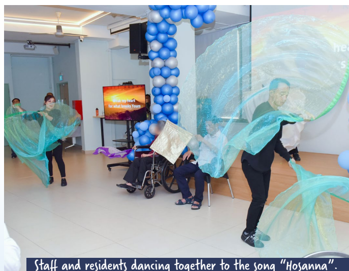
Staff and residents dancing together to the song "Hosanna".