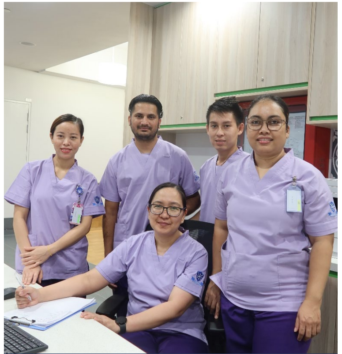
SANH (Aljunied) staff preparing for the nursing home's opening

St. Andrew's Senior Care (SASC) (Tampines North), co-located within SANH (Tampines North), will open in the second half of 2024. It will provide day care and community rehabilitation services as well as active ageing programmes.