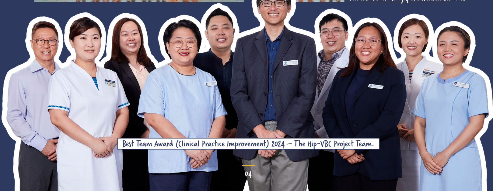
Best Team Award (Clinical Practice Improvement) 2024 – The Hip-VBC Project Team.

St. Andrew's Community Hospital's (SACH) Project Value-based Care (VBC) for Hip Fracture Patients also clinched the Best Team Award for Clinical Practice Improvement. The multidisciplinary team comprising doctors, nurses, allied health professionals, administrators and case managers from Changi General Hospital was formed to address the issue of prolonged hospital stays for hip fracture patients. As a result of the project, the average length of stay for this group of patients showed a remarkable decrease from 33 to 25 days.