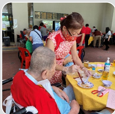
SANH (Henderson) volunteer serving a resident.