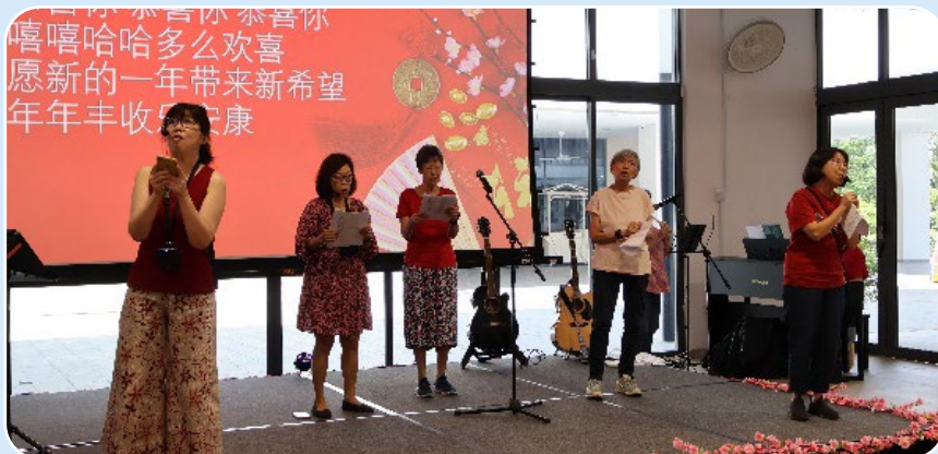
Song performances by volunteers of SJSN NH.