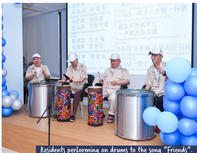
Residents performing on drums to the song "Friends".